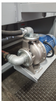
Easy access pump for rapid service removal