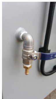
Low water cut out and manual water top up