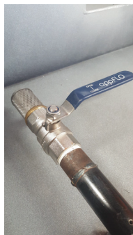
Easy clean spray pipes and nozzles