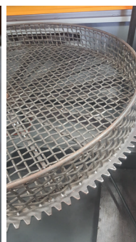
Heavy duty gear drive turntable