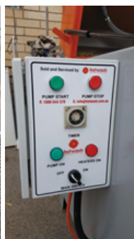
Steel electrical cabinet with IP65 electrics