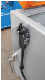
Safety lid switch cuts out during cycle