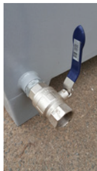
Quick drain tank with no blockage ball valve